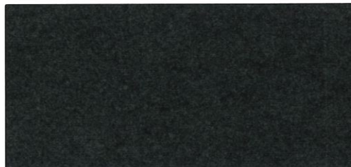
Figure 1. Pulse oximeter sensors

Masimo RD SET pulse oximeter ( SpO_2 ) technology uses a two-wavelength sensor with light-emitting diodes (LEDs) that pass light through the measurement site to a detector as shown in Figure 1. Signal data is obtained by [REDACTED] through a capillary bed, such as the fingertip, hand, or foot shown in Figure 2. This signal measures the changes in the absorption during the blood pulsatile cycle, which the detector receives as variations in light intensity and converts it to an electrical signal and obtains real-time oxygen saturation levels.