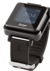
Figure 3. Illustration of an accelerometer.

In our study, motion sensors (accelerometers) resembling a watch (see below) will be worn on both wrists for the 4 weekends and 2 weeks of camp.